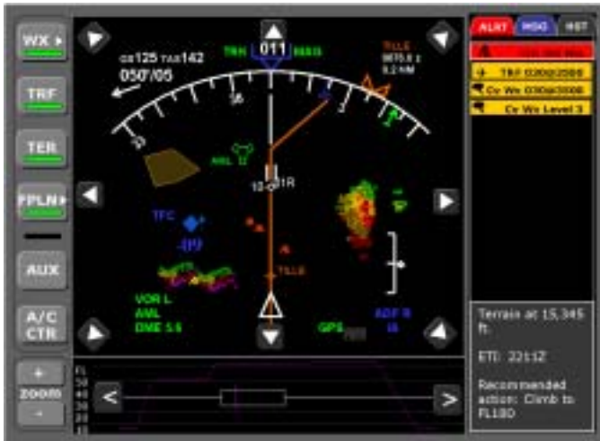
Figure 3. Integrated Alerting on a NAV Display

The ND/MAESA display, illustrated in Figure 3, can be divided into five parts: (1) Display Filter Controls (upper left), (2) Display Area (upper center), (3) Message Area (right), (4) Vertical Profile Display and Range Controls (lower center), and (5) Range Controls (lower left)